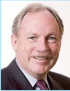
Sir Rod Eddington